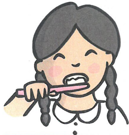
Brush your teeth