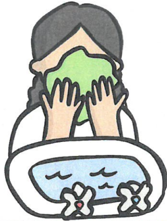
Wash your face