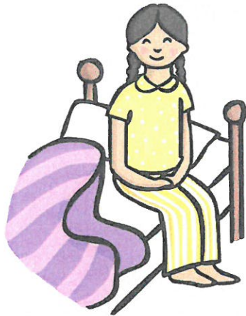
Get out of bed