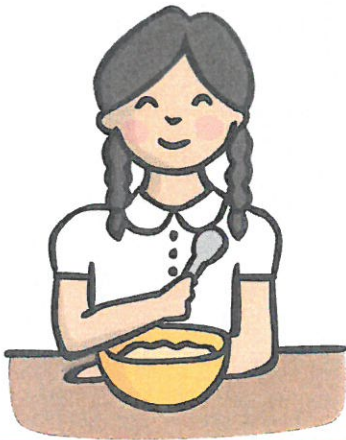
Eat your breakfast